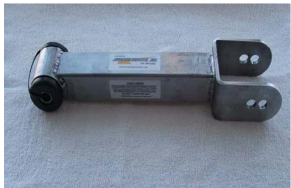
Metric Upper Arm

NOTE: The forward holes in the Johnson Chassis upper arm must be filled or otherwise made non-functional. This will be strictly enforced. The arms must meet OEM length.