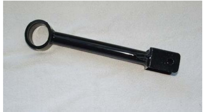
Metric Lower Arm Metric Upper Arm