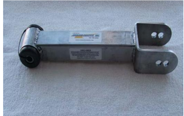
Metric Upper Arm

NOTE: The forward holes in the Johnson Chassis upper arm must be filled or otherwise made non-functional. This will be strictly enforced. The arms must meet OEM length.