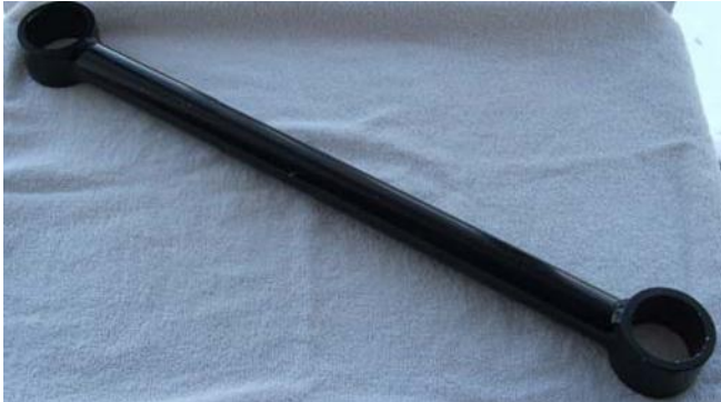
Metric Lower Arm