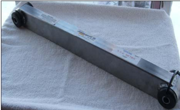
Metric Lower Arm